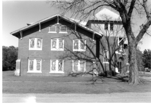
Cherokee Friends Church