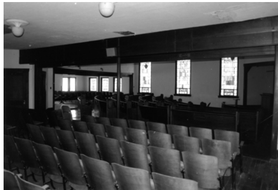
Cherokee Friends Church